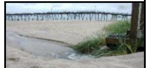
Stormwater outfalls, like this one on a NC beach that empties onto the beach, are noted during a shoreline survey.

MST & CST methods are still relatively new, but may eventually become commonplace in water quality management at the local level.