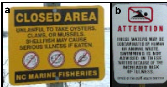
Figure 1. These signs denote (a) waters closed to shellfish harvesting and (b) recreational swimming advisories, due to elevated levels of indicator bacteria.

North Carolina's coastal areas are valued for their economic, ecological, and cultural significance. Our coastal counties rely on both fishing and tourism for their economic health. For example, in 1999, visits to local beaches accounted for approximately 24% of total state tourism, with 11 million visitors to the North Carolina coast 1 . These visitors and residents expect clean waters for commercial fishing, recreational fishing, boating and swimming. Anything that indicates that water is polluted has a detrimental affect on local economies.