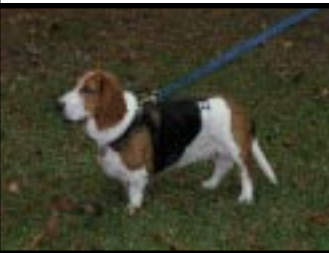
Proper disposal of pet waste will help reduce microbial pollution.

REDUCE IMPERVIOUS SURFACES- The abundance of fecal coliform bacteria in surface waters is associated with the percentage of impervious surface coverage in a watershed 4 . Alternative paving surfaces include washed stone or gravel, paver blocks and bricks set in sand, and grass pavers.